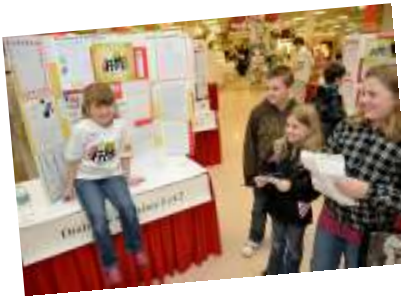
Our youngest participants have the opportunity to share their creativity with friends and family at Imagination at Work.