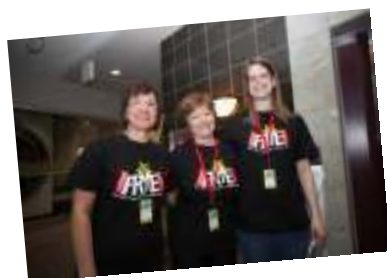
Volunteers proudly sport their Frye Festival t-shirts before the start of a Festival event.