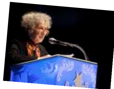
Margaret Atwood delivers the 2011 Mailliet-Frye Lecture.