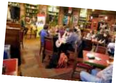
Navigator's Pub is packed in the early evening of a weeknight.

"Thank you for sending us such a great speaker. He had my entire class engaged, which is not an easy feat considering the audience. We were lucky to have such an enriched opportunity, so thank you for thinking of us."