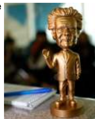
The winner of the Frye Academy award is chosen by a jury of high school students.