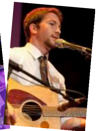
High school students have an opportunity to showcase their prose, poetry and song-writing skills at Café Underground.